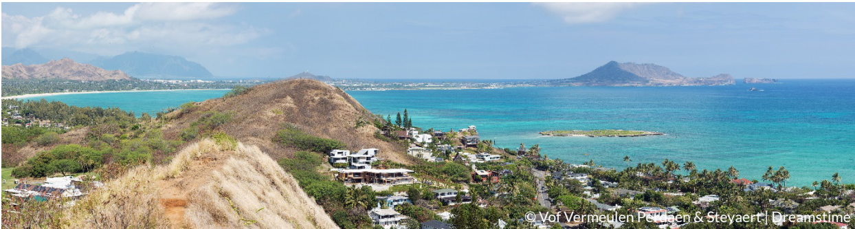
View of Kailua from the Lanikai Pillboxes Trail.

Kailua is one of the wealthiest communities on the island of O’ahu. Lanikai Beach in Kailua is considered by many to be the most beautiful beach in all of the Hawaiian Islands. It’s also a favorite of Hawai’i-born President Obama, who often vacations there. Because of the shape of the island and the resulting wind patterns, the waters off Kailua are usually calm and perfect for swimming, kayaking, and snorkeling.