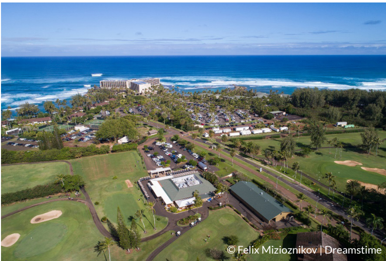
Turtle Bay Resort, Kahuku, Hawaii.