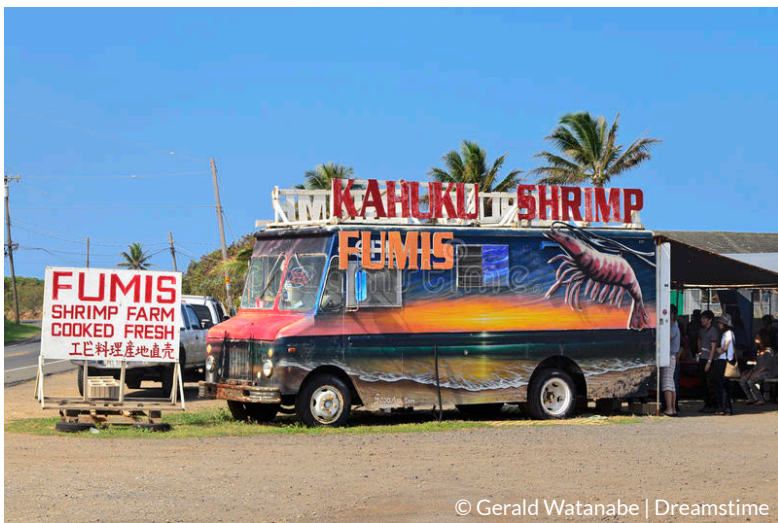
Kahuku Shrimp Wagon.

Even if you've never been to Hawai'i, you may have seen Kahuku – especially its Turtle Bay Resort, which has been featured as the setting for a number of TV shows and movies. While the resort brings a lot of tourists and development, it's also been taking part in recent conservation efforts. The resort installed solar panels on its roof, buys local and organic ingredients for its restaurants, and funds a program that recycles Styrofoam to make surfboards. Near the resort, several World War II-era runways have been converted to golf courses.